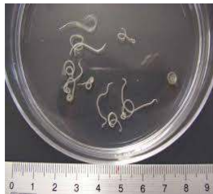
Picture of Anisakis larva